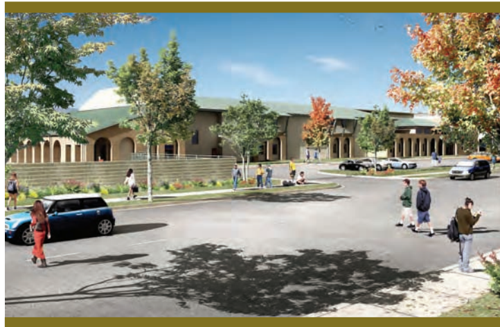
Artist Rendering of Elementary School #29

To that end, the District has purchased property located at the corner of Merrill and Alder. This property will be home to Elementary School #29 and will bring much-needed relief to our two largest elementary schools.