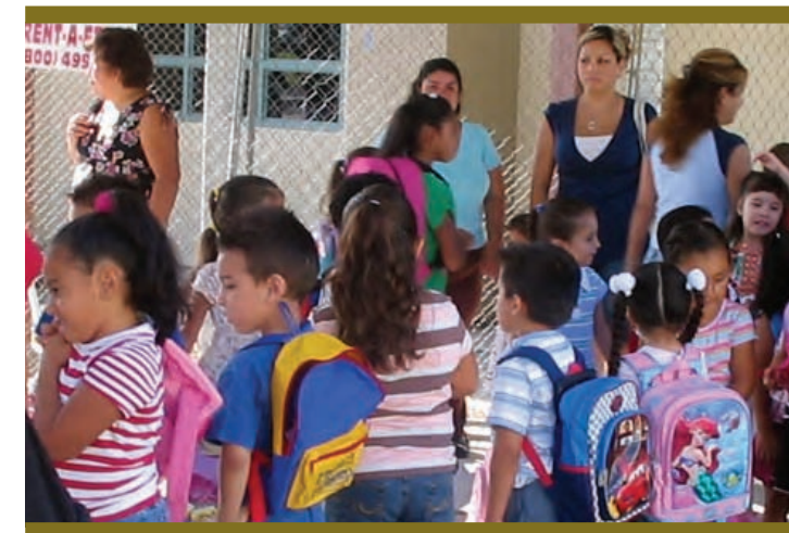
First Day at Kathy Binks Elementary School

The opening of Beech Avenue School allowed Live Oak and West Randall Elementary Schools to adopt the single track, year-round schedule that is the Board’s hope for all elementary schools. Additionally, Kathy Binks Elementary will mean that Juniper Elementary School will also go to the single track schedule for the 08-09 school year. This is a dream realized, thanks to the voters of Fontana Unified School District.