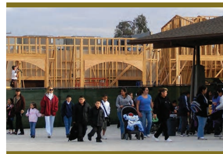
Construction of Phase II at Beech Avenue Elementary School