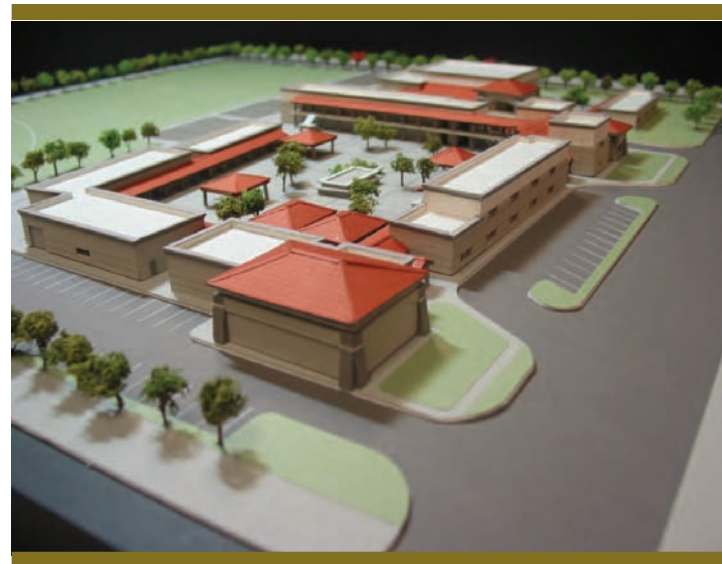
Scale Model of Citrus Continuation High School

The school will be built at Cypress and Santa Ana Avenues, just a block away from the new high school. The advantage of this location is that the two schools will be able to share career/technical classrooms.