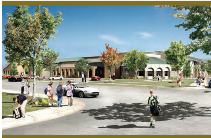
Artist Rendering of Elementary School #29