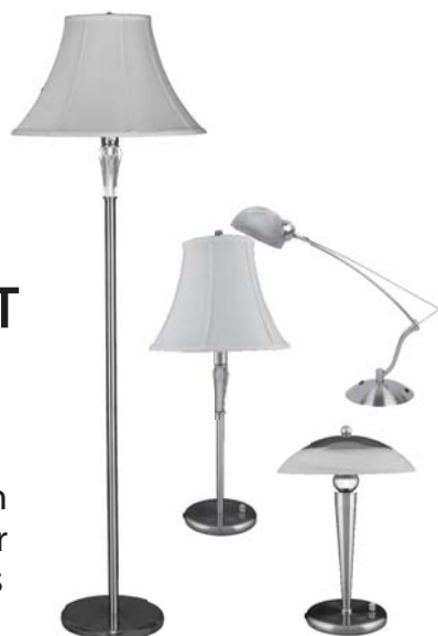
Some Lamp Choices