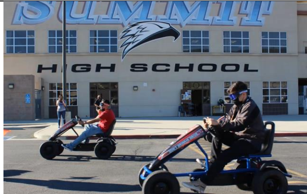
FORENSIC STUDENTS DURING A TOXICOLOGY "DON'T DRINK AND DRIVE" EXERCISE

Library will be closed all day on October 26 th due to testing.